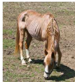
Razzy upon arrival