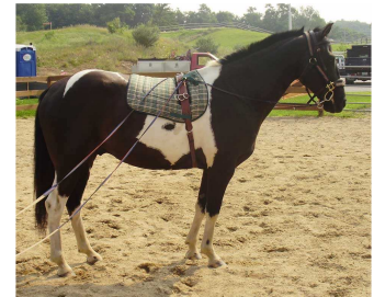
Mr. Tux before adoption