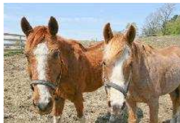
Rusty & Razzy upon arrival

These sweet geldings came to us in the spring of 2008 very thin, with patchy hair and needing much TLC. Health and financial hardships fell upon their previous owner, leaving no money for food or vet care for Rusty and Razzy, who for years were trusted mounts for the children in the family. After months of rehabilitation, Rusty found a special adopter to take on his medical needs. His life is relaxed, living with two rescued miniature horses and calling all the shots. Razzy was still here in October of 2008, and led the way for our Horses Helping Horses Beach Ride as an adoptable horse. This summer, Razzy went to foster at the Plum Grove Equestrian Center , where he met his adoptive family! Razzy, or Razzcal Flats as he is now known, is a member of the Plum Grove Drill Team, and competed in his first show, taking first place in the rescue category. In October 2009, Razzy returned to the MSPCA's Beach Ride with his adopter, to help other horses at Nevins Farm still in need.