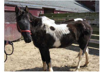
Mr. Tux upon arrival

We were fortunate to find a foster home for Mr. Tux that was able to continue his rehabilitation plan, in a caring and stress-free environment. After several months of foster care, Mr. Tux was well enough for us to start work, and he was an absolute revelation! We were thrilled to find that he had some training under his belt, and we were able to find a perfect match for him. Hats off to his wonderful foster family that was so instrumental to his success!